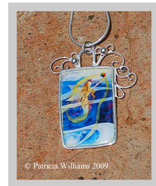
Set your sights higher" ©2009 $70.00