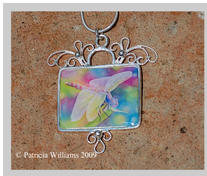
"Magical Dragonfly" Pendant $75.00