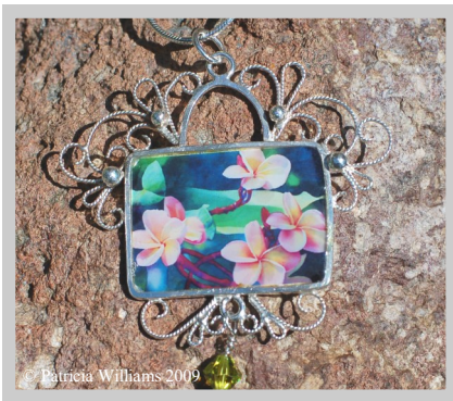
"Hawaiian Memories" Pendant $85.00

Let me design a pendant especially for you. All I need is a high resolution file of your picture so that I can size it (keeping the correct ratio). I then design the pendant to the size of the picture. All designs are done in Sterling Silver.